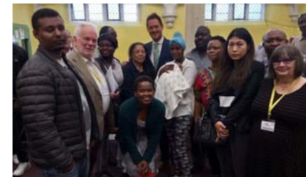
Friends without Borders

Action 5 Welcoming everyone for a cup of tea at the end of our journey donations for Friends without Borders small charity supporting refugees in Portsmouth.